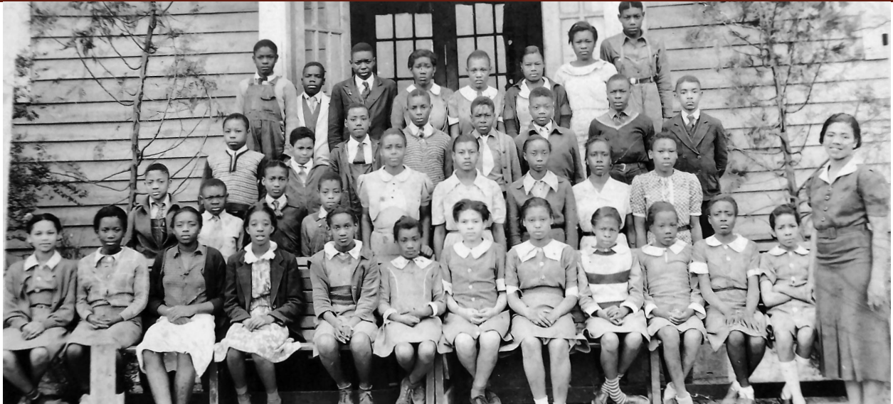
Students at the Randolph County Training School in Alabama (c 1940)

Julius Rosenwald invested in people through education and that investment is still paying dividends. Today, as in Rosenwald's lifetime, education is key to a better life for individuals and to moving America forward.