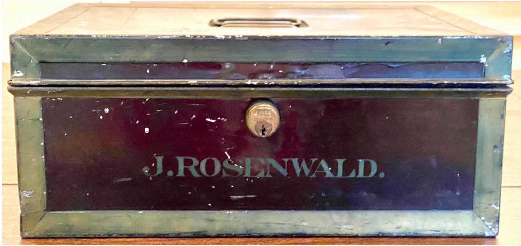
Strongbox from the office of Julius Rosenwald.

We also continued to grow our collection of books . The Campaign now owns five books that were part of small library sets sent to rural schools in the South from 1928 to 1948 as part of the Rosenwald Fund’s library services program. At first, the library sets were only for African American elementary schools. Later, library sets were made available for African American secondary schools as well as schools for white children. Four of the books we acquired were for elementary students, while the fifth, Golden Slippers , a book of poetry edited by Rosenwald Fund fellow Arna Bontemps, was for junior and high school students.