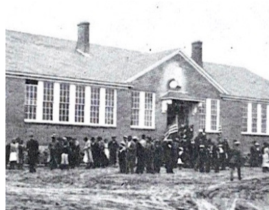
Dedication of the Eleanor Roosevelt School in Warm Springs, Georgia.