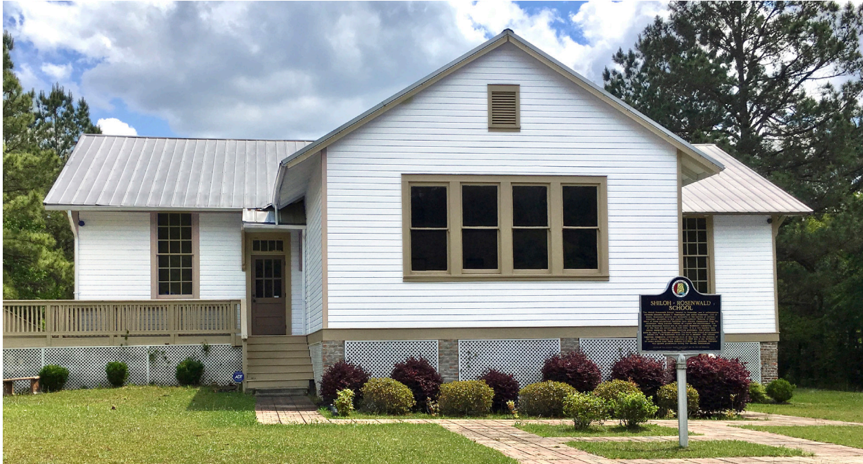
The Shiloh Rosenwald School located in Notasulga, Alabama.