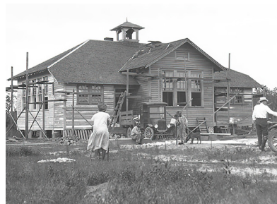
Construction of the Maple Hill School in North Carolina.