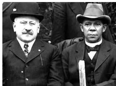
Julius Rosenwald with Booker T. Washington