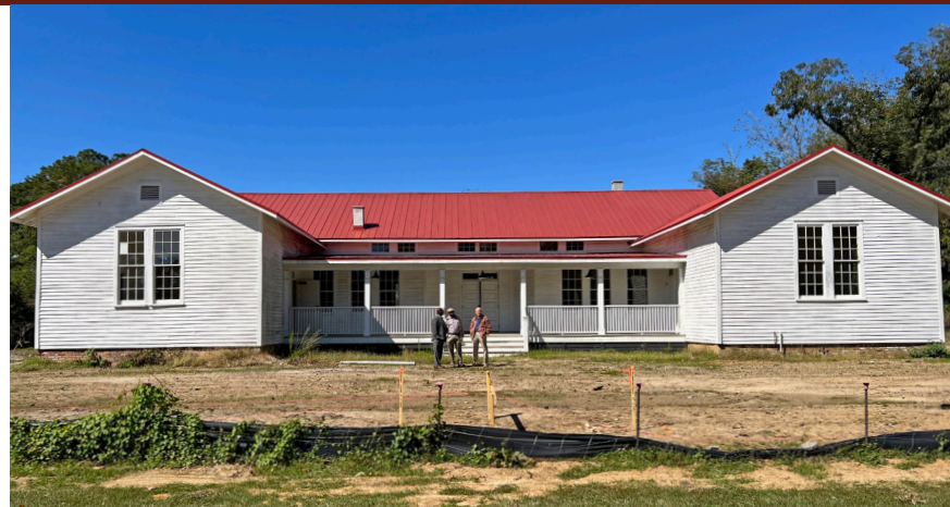
The St. George Rosenwald School had been on the verge of collapse (left) before the town of St. George, South Carolina, decided to restore it (right).